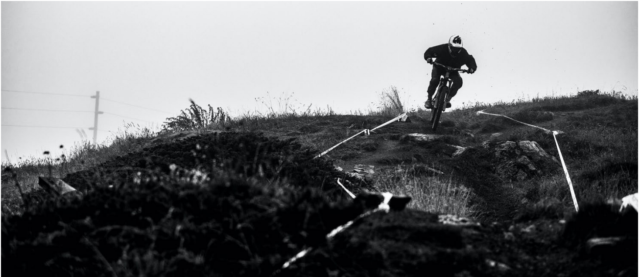
Figure 1 Tape on both sides close to the ground protected from wind

If there are two pieces of tape on either side of the trail, the rider must ride between them. In these areas, crossing or bypassing the tape is considered a shortcut.